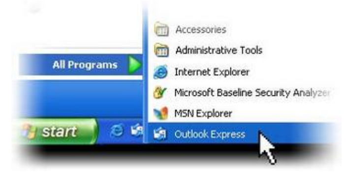
Opening Outlook Express from the Start menu

These first three steps are shown in the image below: